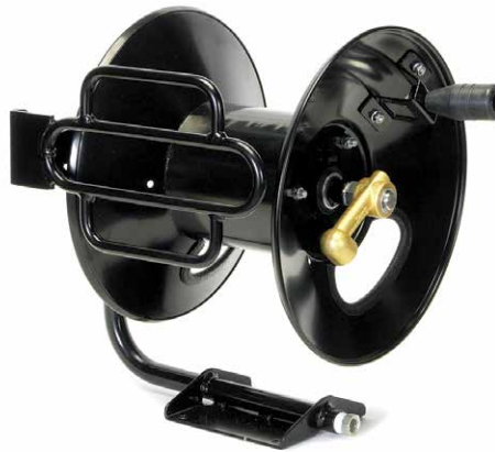
Fixed Base Hose Reel