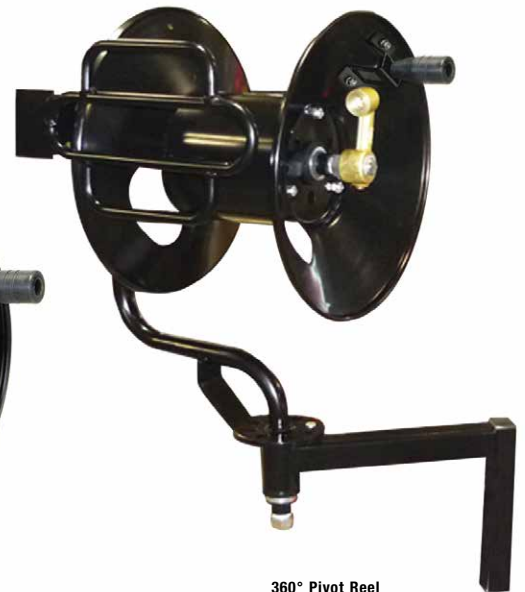
360° Pivot Reel